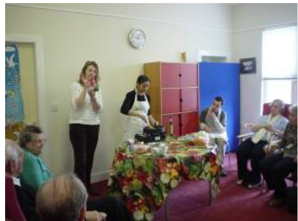
Help demonstrating healthy eating to our Monday Group